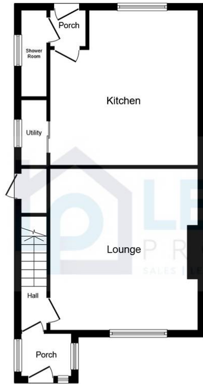
Ground Floor Floor area 57.0 m 2 (614 sq.ft.)