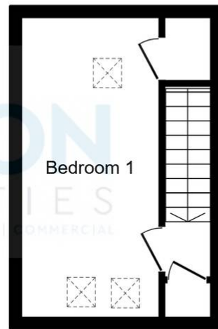
Second Floor Floor area 17.3 sq.m. (186 sq.ft.)